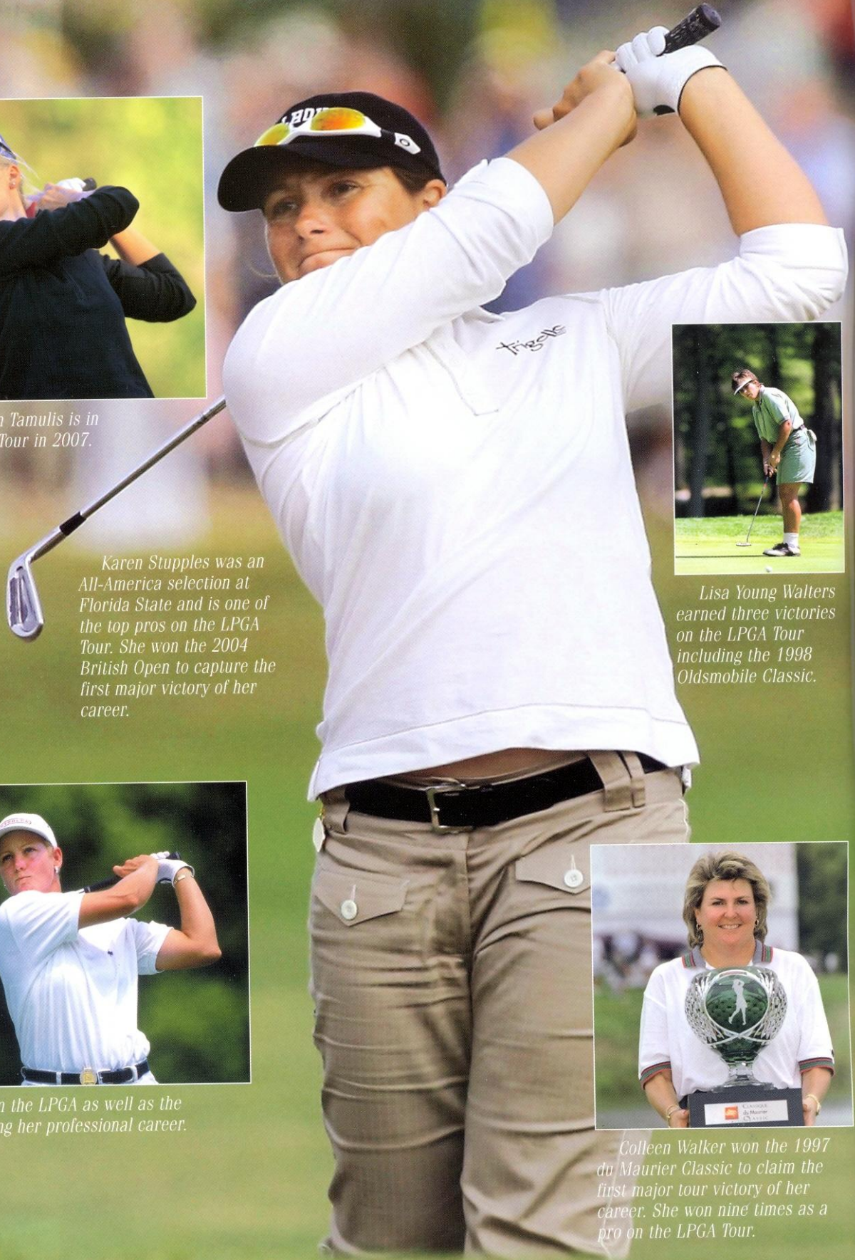
Karen Stupples was an All-America selection at Florida State and is one of the top pros on the LPGA Tour. She won the 2004 British Open to capture the first major victory of her career.