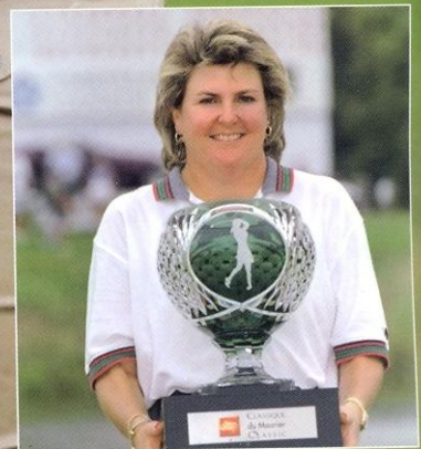
Colleen Walker won the 1997 du Maurier Classic to claim the first major tour victory of her career. She won nine times as a pro on the LPGA Tour.