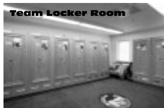
Team Locker Room