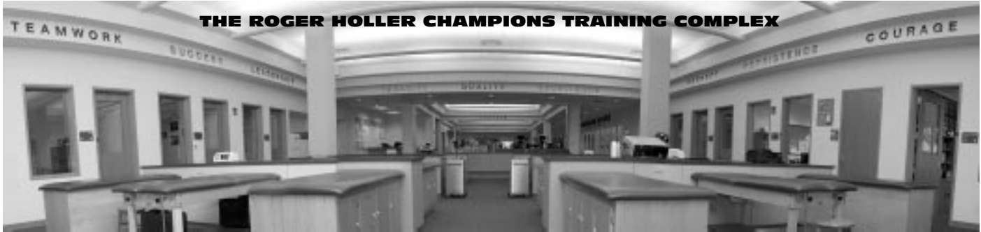
THE ROGER HOLLER CHAMPIONS TRAINING COMPLEX

Completed in 2003 and utilized by the Seminole golf team, the new weight room in the Moore Athletic Center is regarded as one of the top workout facilities in the country. The weight room covers more than 15,000 square feet and is open to the golf team all year round.