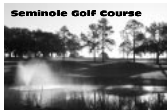
Seminole Golf Course