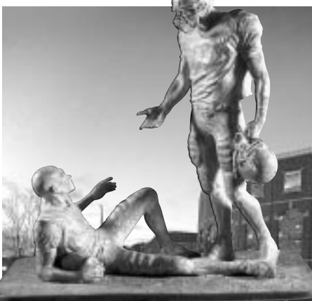
DOAK CAMPBELL STADIUM