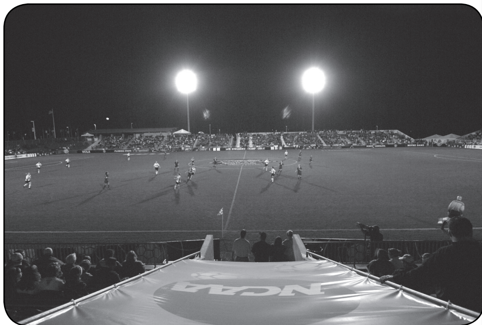
The Seminoles are looking to make their third consecutive trip to the College Cup in 2007.