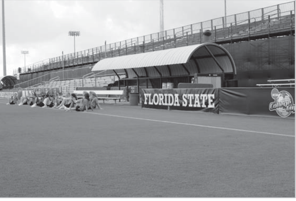
FSU has advanced to three straight College Cups and four in the last five years

"Once again, the foundation of our team is very strong. I am excited to see what is in store for this team with the players that are returning and the newcomers that will be joining us. This is the time of year that we all really enjoy as the players return to campus in preparation for the start of the upcoming season. This year we combined quite a bit of experience with some youth which I think is healthy for a team having players that will come in and challenge for playing time. The goal of course is to integrate the young players into the team and use the experience that the veteran players have earned over the course of time to help them along. If we can make that work for us then I feel we have a chance of being very successful."