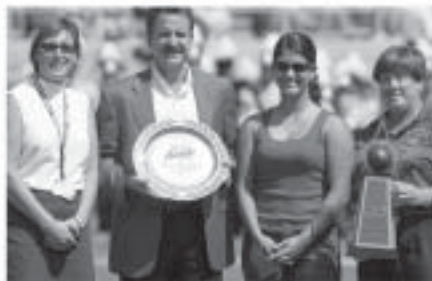
Half time recognition at the UNC football game.