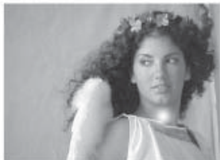
Sports Illustrated photo shoot

2004 USA Softball and Honda National Player of the Year