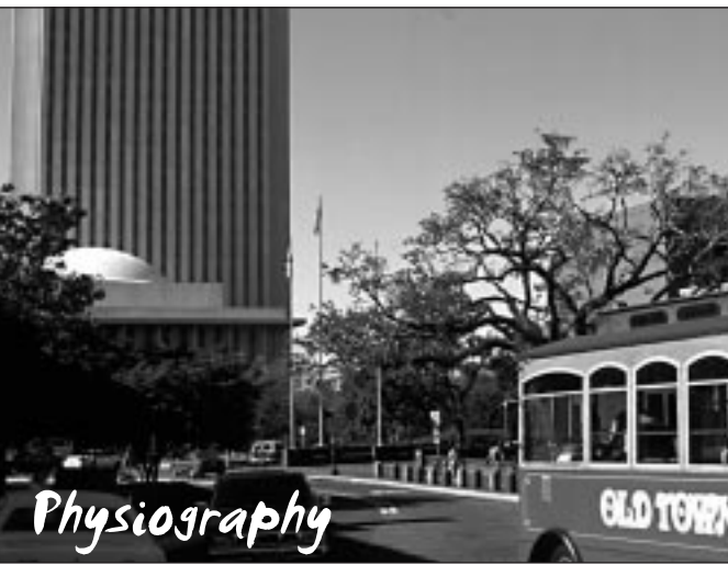
Tallahassee's rolling landscape, typical of regions further north, is unique among the major cities of Florida. Some areas of the county, including the downtown ridge encompassing the Capitol complex, City Hall and the County Courthouse, exceed elevations of 200 feet. The highest elevation in Leon County is 288 feet, found in the northern part of the county. To the south of the city, the hills yield to the flat terrain that is typical throughout the peninsula of Florida.