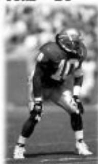
Derrick Brooks Academic All-American