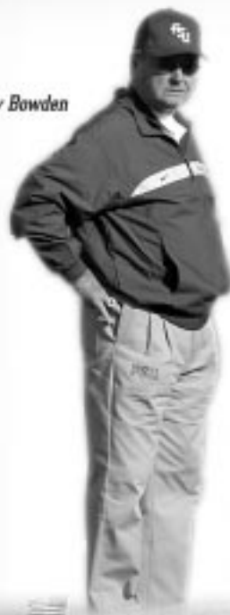
Coach Bobby Bowden

COACHES OF THE YEAR National Coach of the Year Total - 7