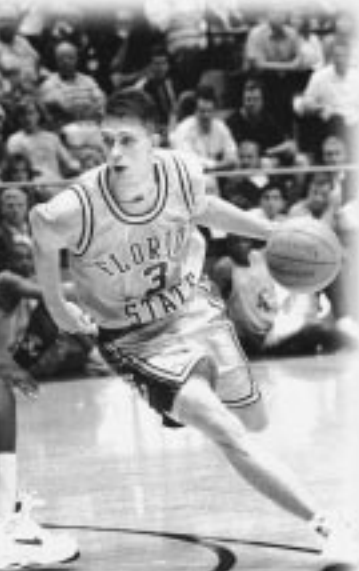
Bob Sura All-ACC