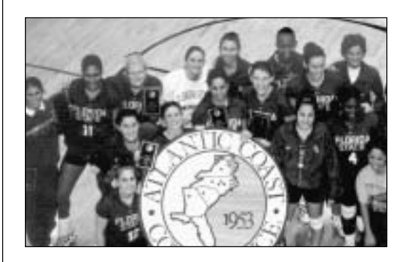
1998 ACC Champions