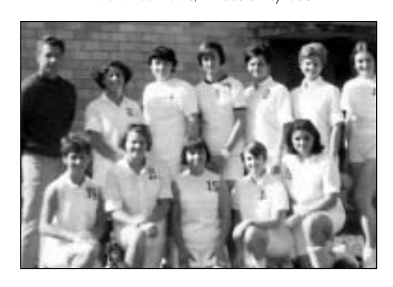
1968, FSU's first volleyball team