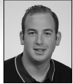
BRANDON GOODMAN Sports Information Staff Photographer