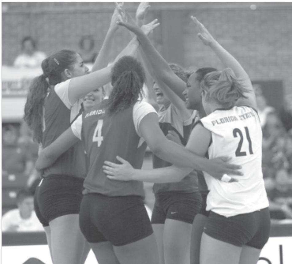
The Seminoles have laid the foundation and are poised for success in 2006.