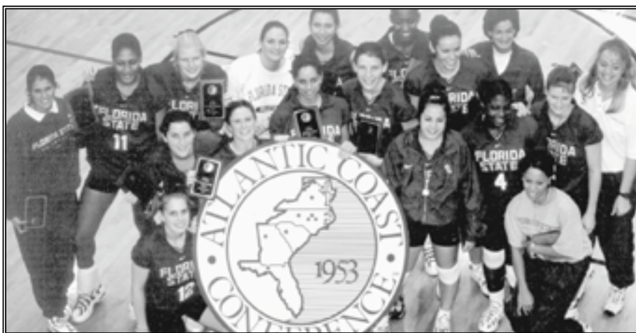
1988 ACC Champions

Team Nike on the pro beach circuit. She has had a fitness column in ELLE Magazine and appeared on MTV Sports. Reece co-authored her first book Big Girl in the Middle and has been featured on Lifetime Television's Intimate Portrait .