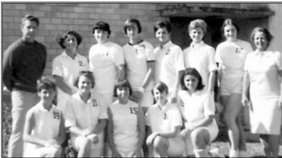
FSU's first volleyball team in 1968