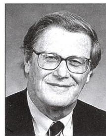
JOHN THRASHER MOORE-STONE AWARD