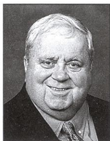
JIM KING MOORE-STONE AWARD

In 1986, Jim King was elected to the House of Representatives where he served 12 years and in 1999 he was elected as Senator where he continues to serve today.