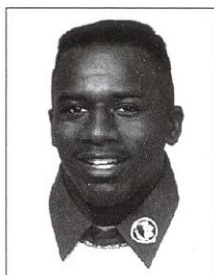
TERRELL BUCKLEY Football

Terrell Buckley was among a few 1989 signees to see action in his rookie season when he ranked 9th in the nation in punt returns and saw significant time at cornerback. As a junior, the consensus All-American demolished the school record for interceptions in a season by picking off 12 passes and took over the FSU record for career interceptions with 21. In January 1992, Buckley was named the winner of the Jim Thorpe Award presented to the best defensive back in college football.