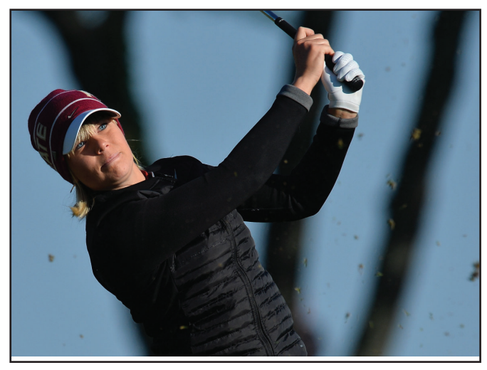
Matilda Castren strengthened her Symetra Tour status and earned her LPGA tour card during the fall of 2019.