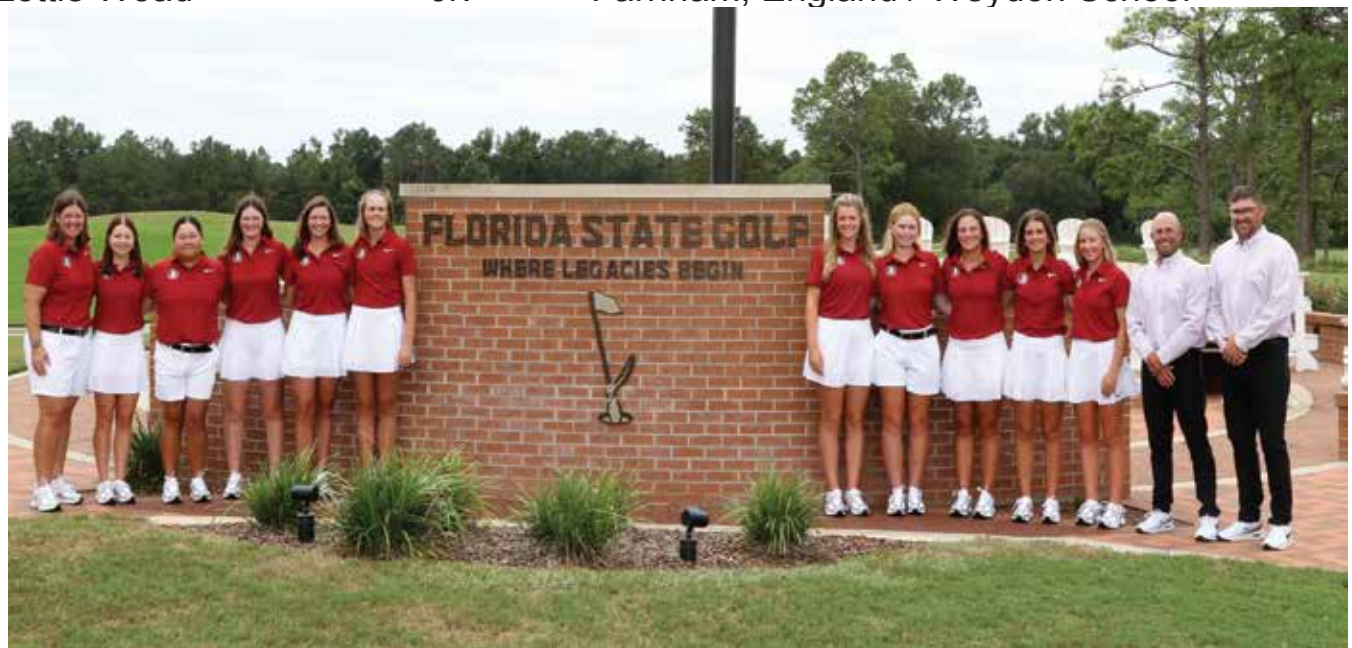
2024-25 COACHING STAFF