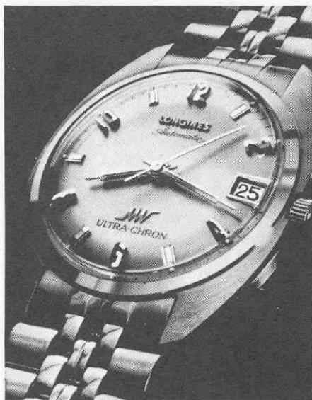
Longines Ultra-Chron #8205, automatic with calendar, $175. Other Ultra-Chron Models, $150 to $595.

Longines watches are recognized as OFFICIAL for timing world championships and Olympic sports in all fields throughout the world.