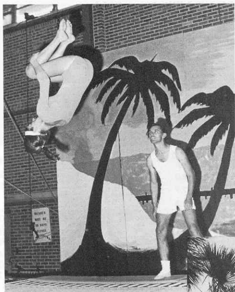
Members of The Gymkana Court