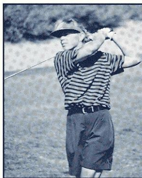
Arizona's Annika Sorenstam