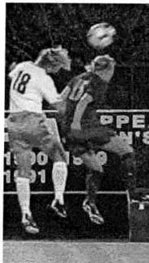
The Seminoles will play in their first-ever ACC Championship Sunday afternoon against No. 1 North Carolina.